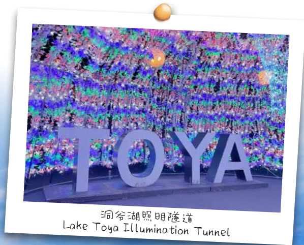
洞爷湖照明隧道 Lake Toya Illumination Tunnel