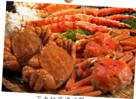
三大北海道螃蟹任吃 3 Kind Hokkaido Crab & Buffet