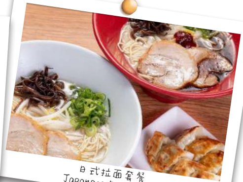
日式拉面套餐 Japanese Ramen Set