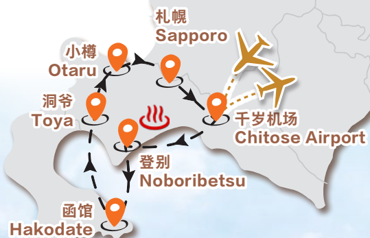
函馆早市 Hakodate Morning Market

※ Sequence of the itinerary is subject to change according to the final flight confirmation.