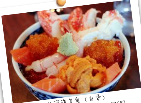
北海道美食 (自费) Hokkaido Gourmet (Own expense)